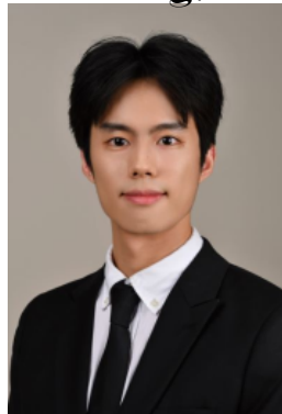
Do Monte Lab

"Mapping the neural circuits that underlie metabolic vs. emotional regulation of food-seeking behavior"